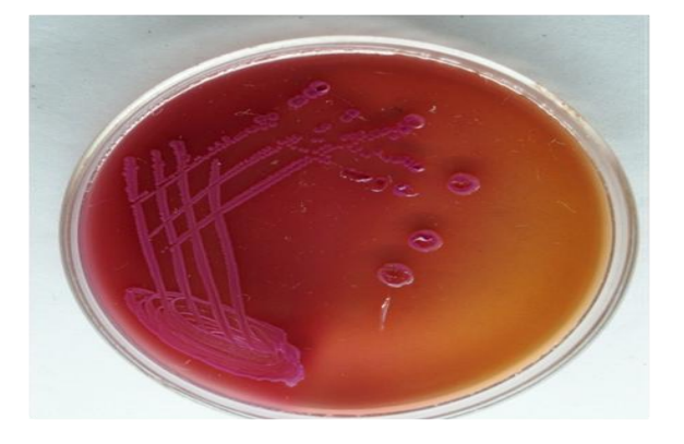
Figure.1 Pure Isolates or Colonies of Escherichia Coli on Macconkey Agar Plates